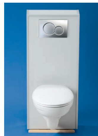
Example: WC block 100cm high, clad with white decorative panels, flush panel "Sigma01"