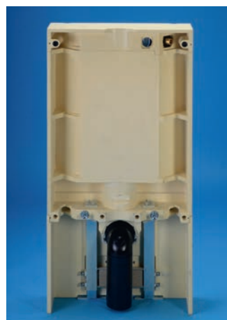
Grumbach WC blocks: assembly-ready for installation and connection.