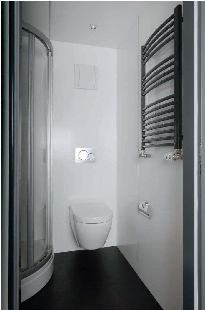
Figure shows special equipment