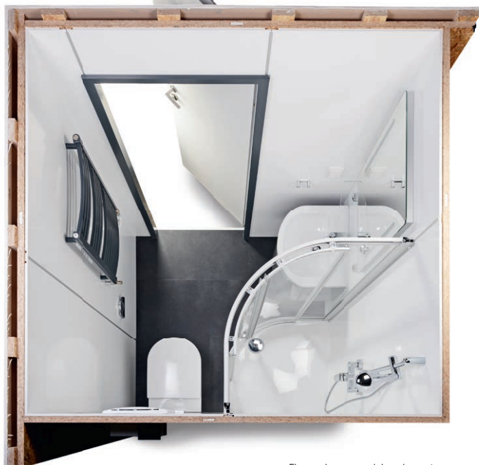
Figure shows special equipment