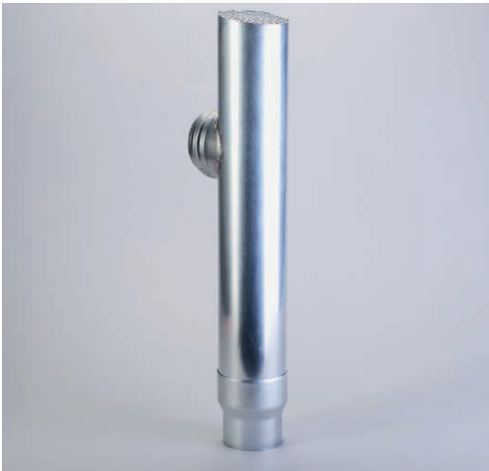
Attica downpipe connection made of titanium zinc DN 70 in combination with a reducer from \varnothing 87 mm to \varnothing 80 mm.