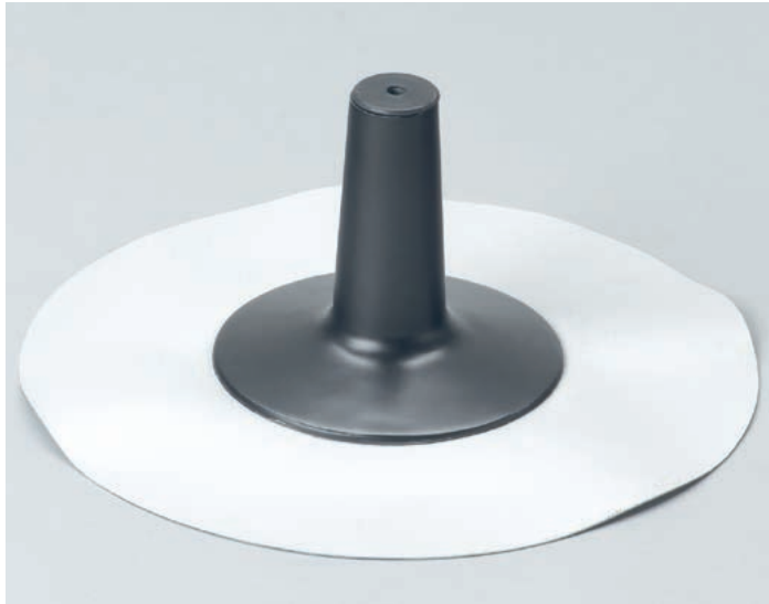
Fastening bushing made of PUR (black) Heat insulated, CFC-free, with integrated rubber seal and foamed connection collar (Bitumen, PVC or special foil)