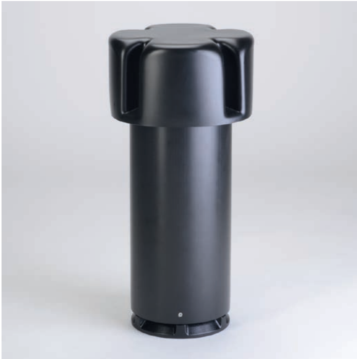
Grumbach condensation drain including: condensation drain ring, ventilation pipe DN 150 (400 mm long) and rain cap DN 150