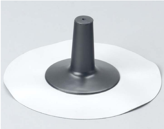
Fastening bushing made of PUR (black) Heat insulated, CFC-free, with integrated rubber seal and foamed connection collar (Bitumen, PVC or special foil)