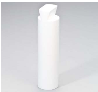
Matching element made of EPS for filling revision openings in the insulation