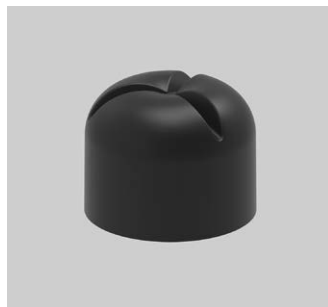
Rain cap DN 125