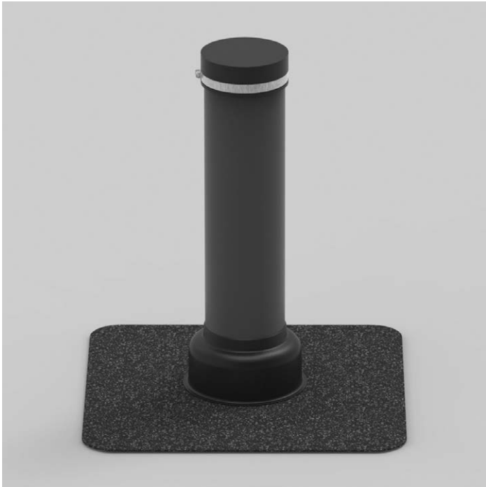
Reach-through element DN 125 with rubber cap and clamp