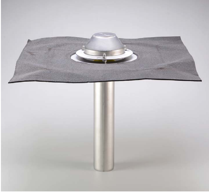
Siphonic drain made of stainless steel (top part) with bitumen collar, vacuum plate and pebble trap.