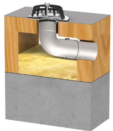
Stainless steel drain horizontal DN 70 in a ventilated roof