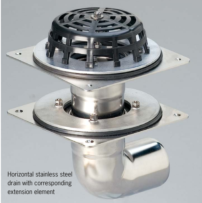
Horizontal stainless steel drain with corresponding extension element