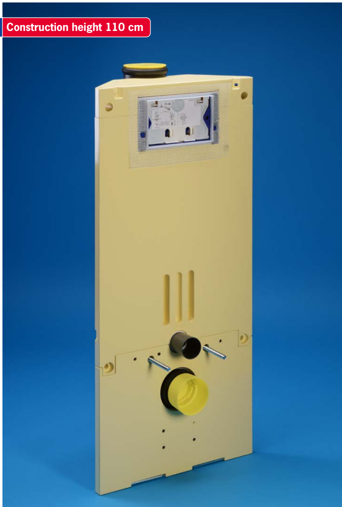
WC-block 110 cm high, slanted (Art. No. 1601.N), here shown with moulded connection piece (Art. No. 1906)

■ WC-block 110 cm high, slanted, for flush panels "Sigma 01/10/20/21/30/50" (Geberit®) without moulded connection piece